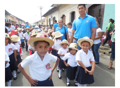
Marching in the Parade

This year NCS was first place in the 60 schools in NCS district as rated by the Ministry of Education. This placed NCS at the front of a very big and important parade through downtown Leon & NCS carried the banner and the Nicaraguan flag.