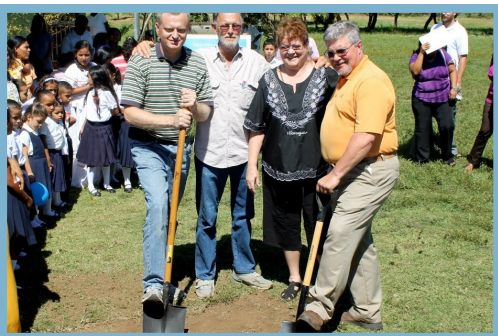
Groundbreaking for Multipurpose Building