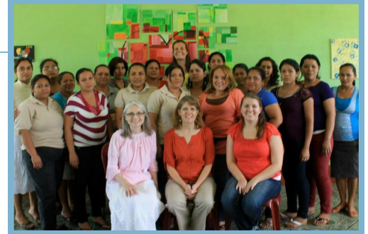
Bible Curriculum Training

At the Nicaraguan Christian School, the memory I will most treasure is the earnest participation of the teachers in the seminar that was provided for them. We began with an emphasis on their relationship with God and a presentation of