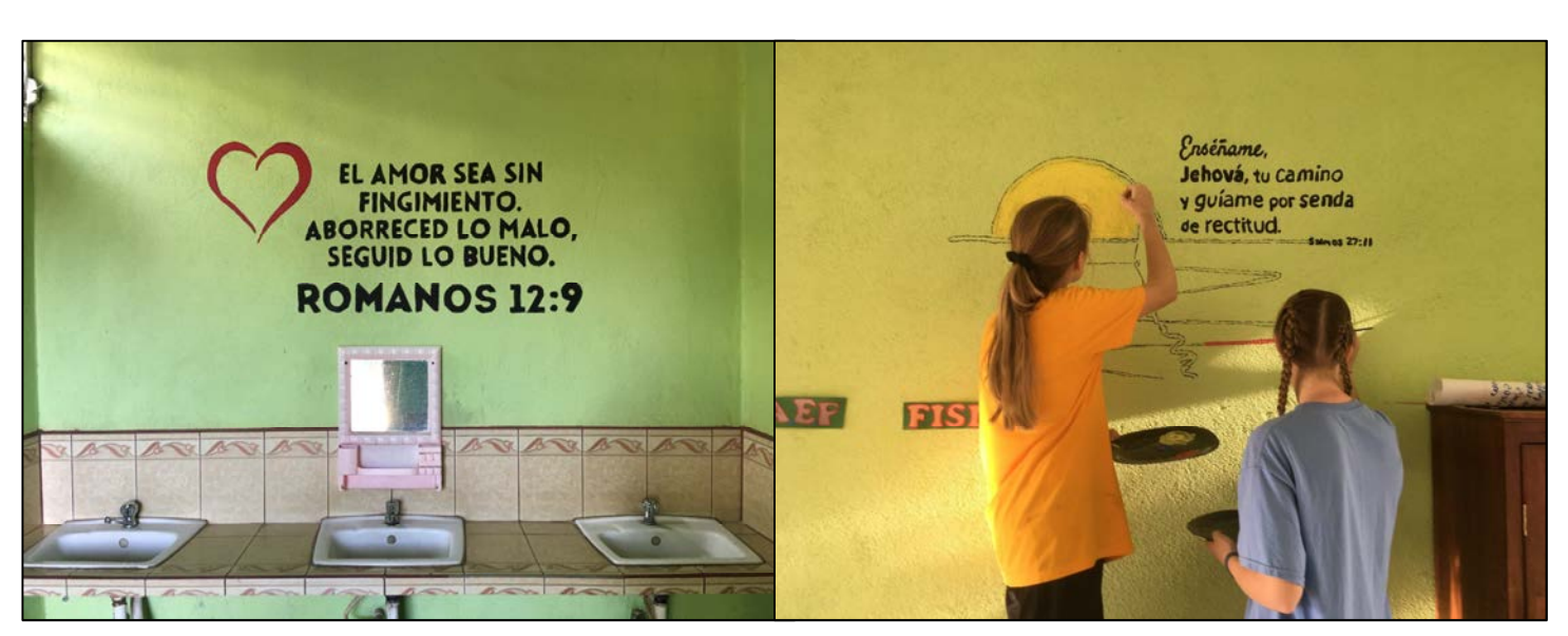
image on the right: "Teach me Lord your way and guide me in the straight path." Psalm 27:11