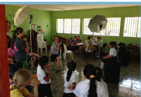
JCS taking school pictures