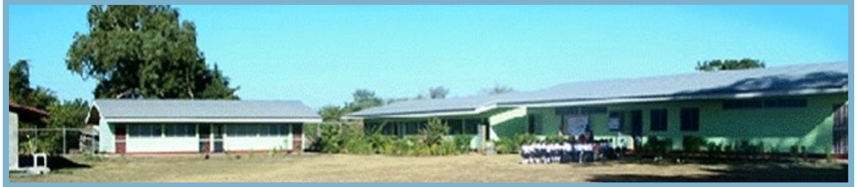
Providing a Christian education today and a hope for tomorrow...