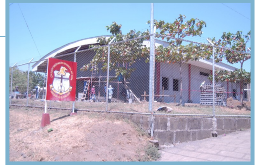
New building from the road

What a great way to spread the gospel to that community. The way has been opened to spread Gods word in that area.